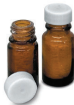
GRÂNULOS EM RECIPIENTE DE VIDRO GRANULES IN GLASS