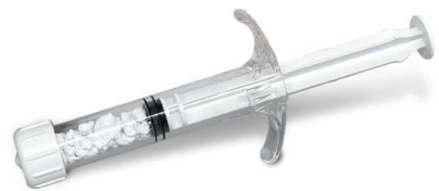
GRÂNULOS EM SERINGA GRANULES IN SYRINGE